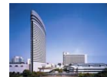
Kobe Portopia Hotel, Official Congress Hotel