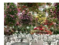
Kobe Kacho-en, Welcome Reception venue