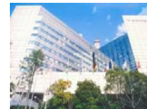
Kobe Int'l Conference Center